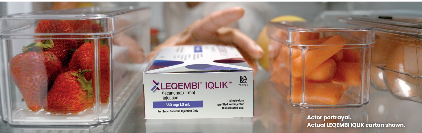
Actor portrayal. Actual LEQEMBI IQLIK carton shown.

Do not take LEQEMBI IQLIK out of the carton or remove the cap until you're ready to inject.